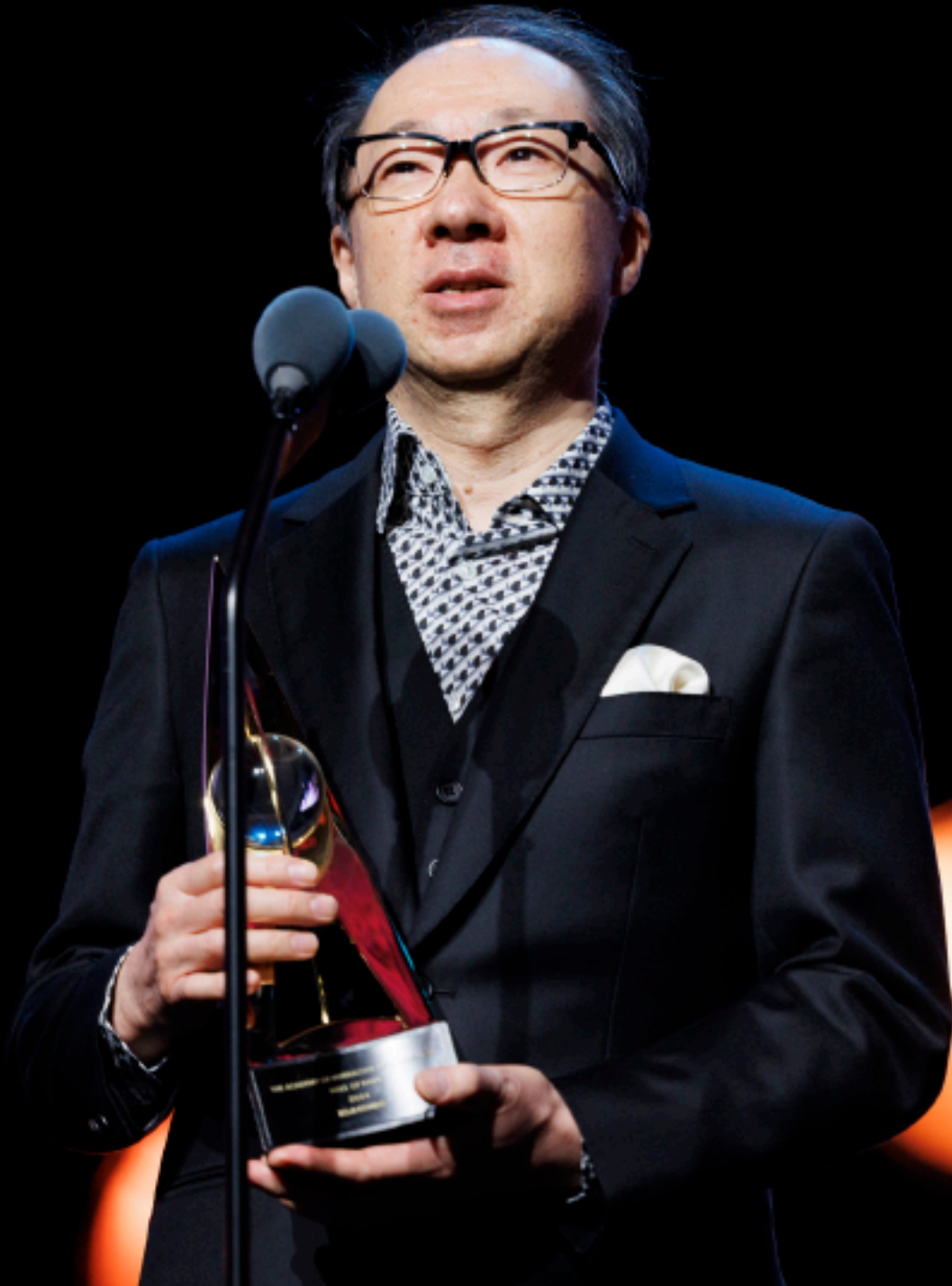
KOJI KONDO NINTENDO