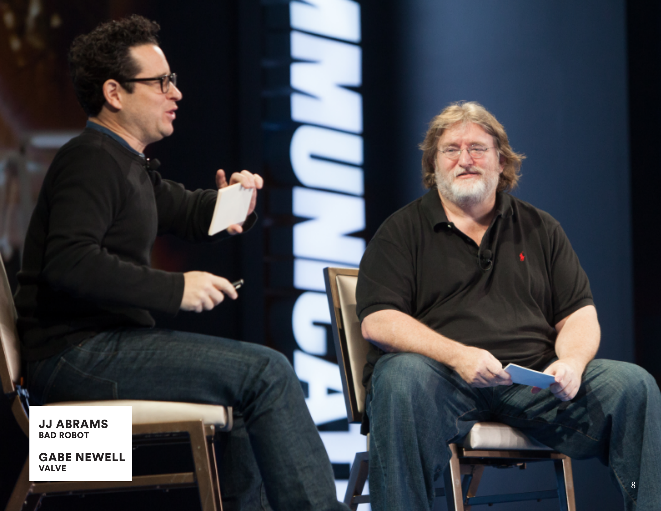
JJ ABRAMS BAD ROBOT